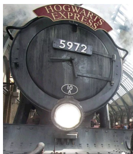
September 1 Hogwarts Express Departs for 1st Day of School

*Include full meeting information with your payment