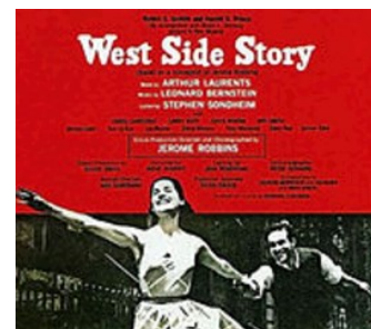
September 26, 1957 West Side Story Opens on