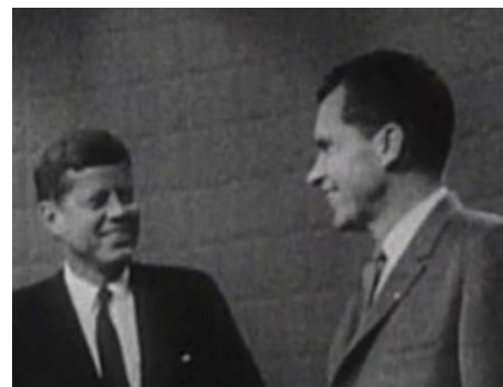
September 26, 1960 1st Televised Pres. Debate, Chicago