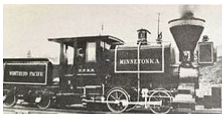
September 8, 1883 Northern Pacific RR Completed