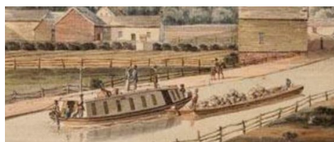
November 4, 1825 Erie Canal Opens in New York

*Include full meeting information with your payment