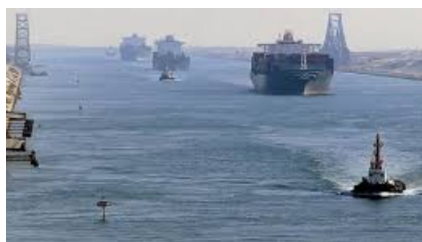
November 17, 1869 Suez Canal Opens