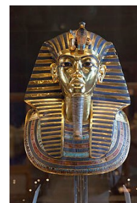
November 26, 1922 King Tutankhamen Tomb Found