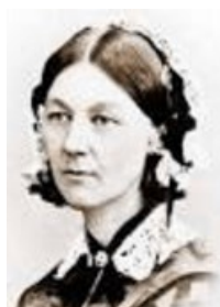
May 12, 1820— Florence Nightingale is born