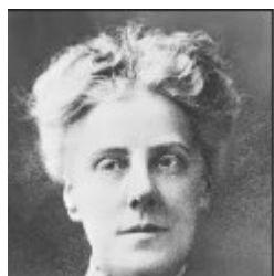
May 8, 2016—Mother's Day Pictured: Anna Jarvis

*Include full meeting information with your payment