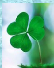
Saint Patrick's Day March 17