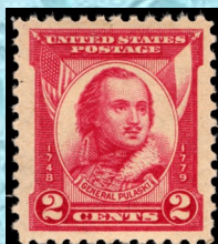
Casimir Pulaski's Birthday March 4, 1747

7th Tradition Support OA the 60/30/10 Way!