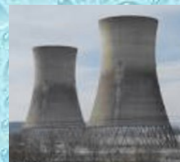
Three Mile Island Accident March 28, 1979