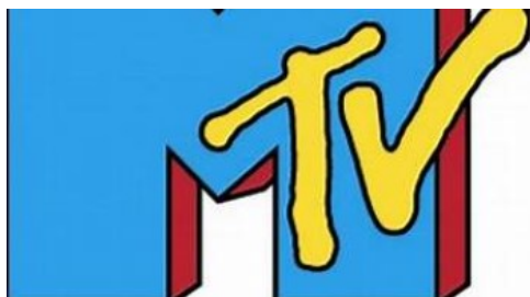
August 1, 1981 MTV Debuts

*Include full meeting information with your payment