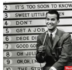
August 5, 1957 American Bandstand ABC Debut