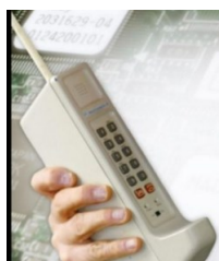
April 3, 1973—First Mobile Phone Call

*Include full meeting information with your payment