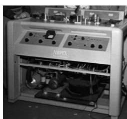
April 14, 1956—Ampex Introduce the First Commercial Videotape Recorder